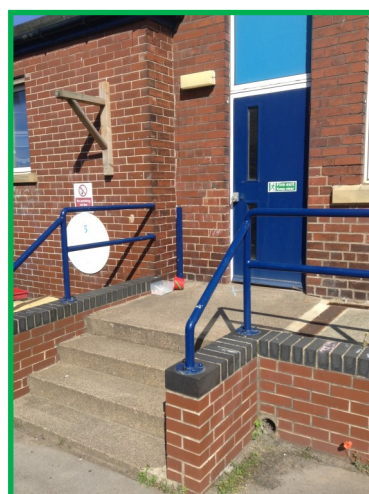
Classroom door (outside)