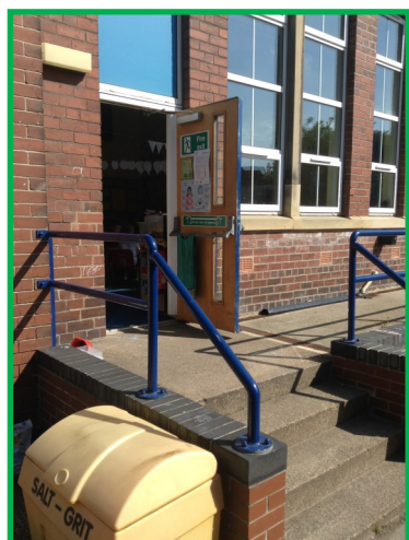
Classroom door (outside)