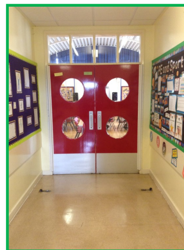
The hall—where I will have my dinner, go to assembly and have PE sessions