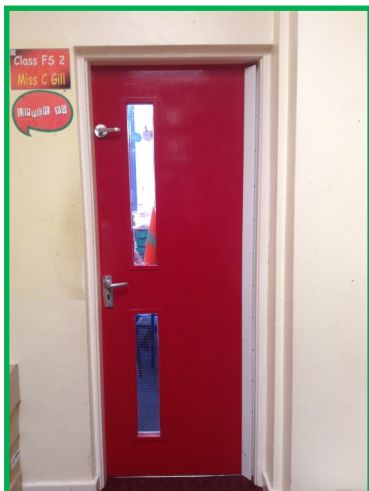
Classroom door (inside)