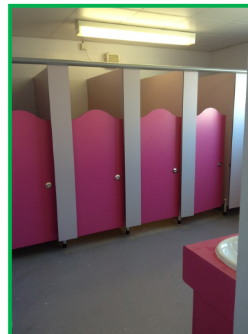
Toilets and sink area